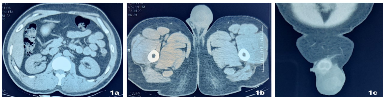
Figure 1. CT scan of a patient with isolated epididymal tuberculosis showing a. Normal appearing kidneys. b. Hydrocele of the left testis with turbid contents. c. Hydrocele showing thickened tunica vaginalis.

Routine ultrasonography of the kidney, ureter, and bladder regions was performed in all cases. Six (10.7%) patients showed small non-significant renal calculi. The rest of the examination was unremarkable. Computed tomography was done in 38 (67.8%) patients, revealing a normal urinary tract (Figure 1 a, b, c).